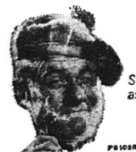
Super Perma-Sharp - as smooth as Scotch whisky

*Super Perma-Sharp also comes in a new-look three-blade dispenser. You get the Super Trial Offer with this dispenser, too.